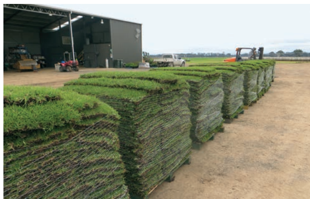
Village Green premium kikuyu slabs

Village Green premium kikuyu tested at Exhibition Park Canberra during July. Three weeks later after subzero temperatures it still has a green cover and well established roots.