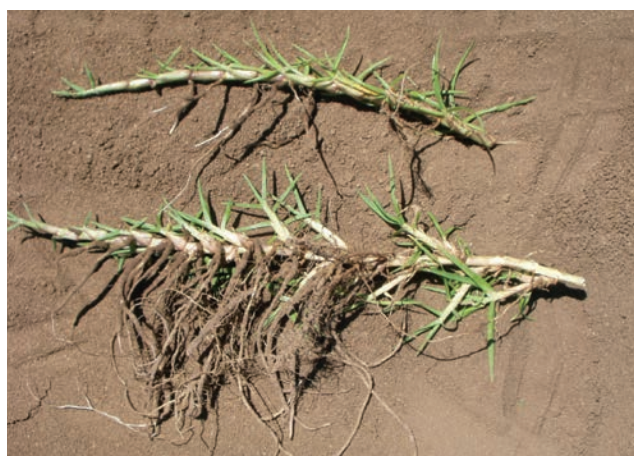
Village Green premium kikuyu (bottom) versus common kikuyu (top) stolons