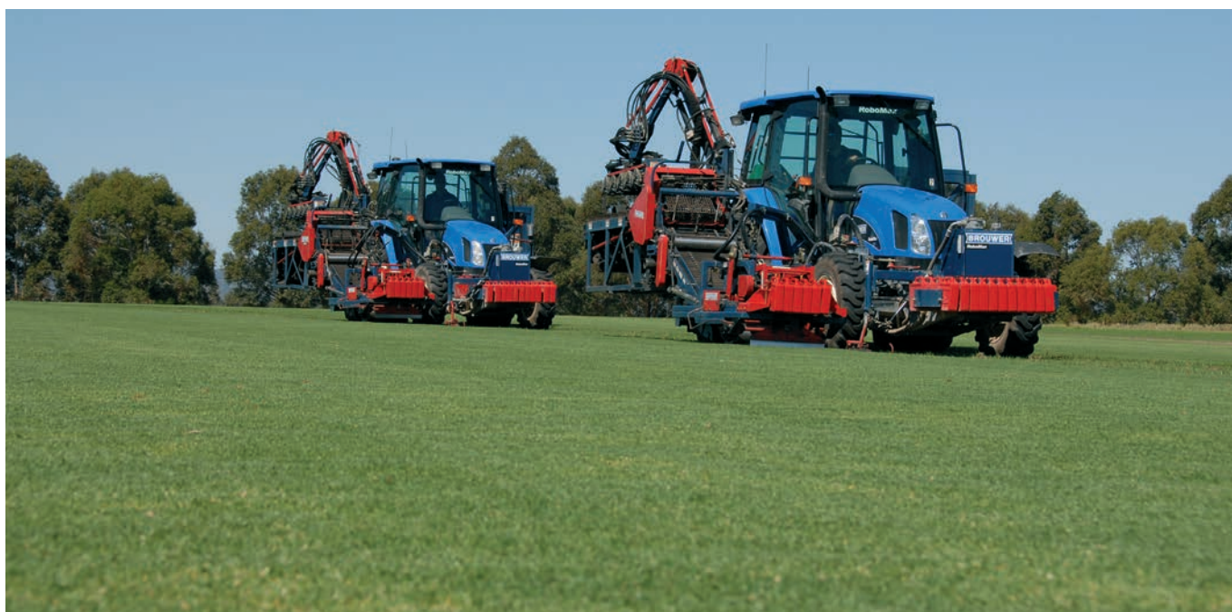
Harvesting Village Green premium kikuyu

For a list of local suppliers please go to www.villagegreenturf.com.au