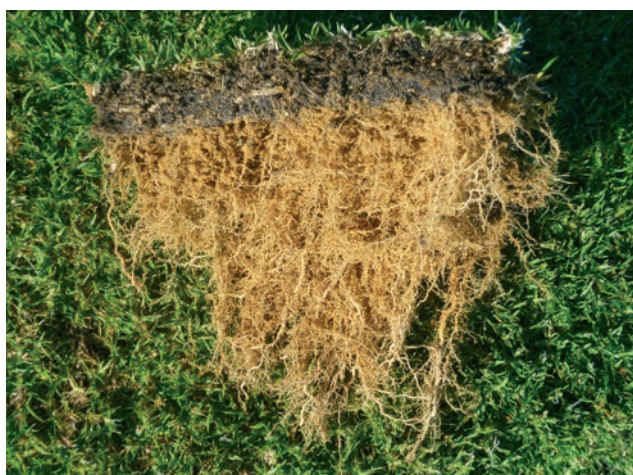
Village Green premium kikuyu's massive root system