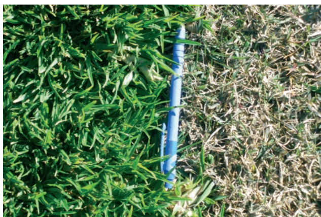
Village Green premium kikuyu (left) versus couch (right) in winter