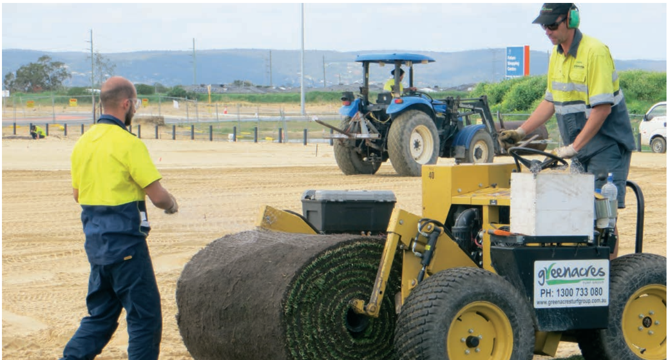
Laying Village Green premium kikuyu large rolls