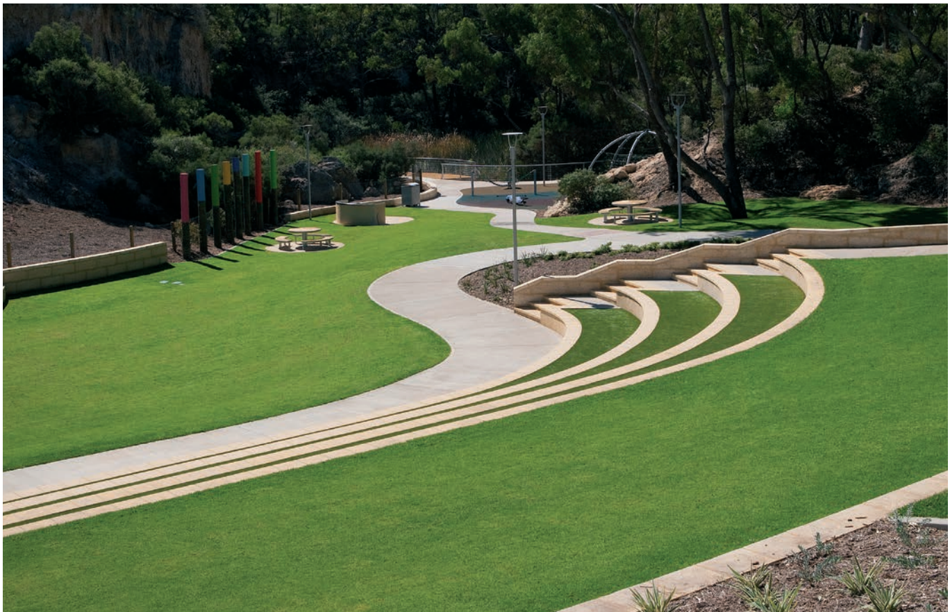
Meadow Springs Mandurah