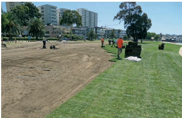
Laying Village Green premium kikuyu standard rolls