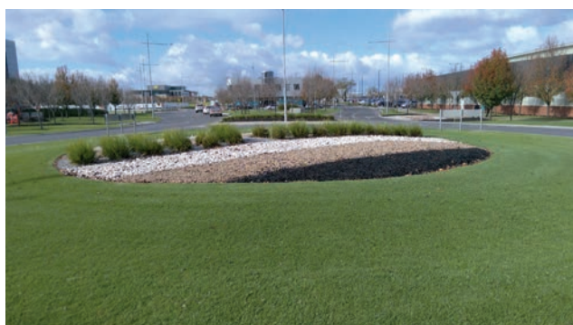
Essendon Fields Melbourne