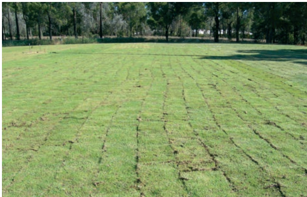
Poorly laid job