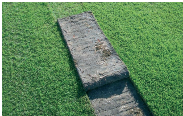
Quality Village Green premium kikuyu