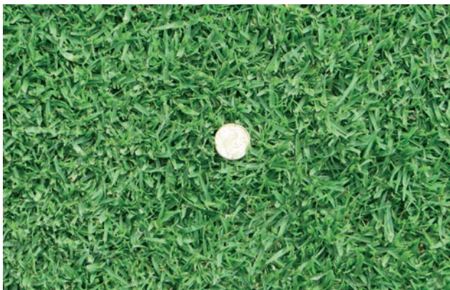
Village Green premium kikuyu low mown