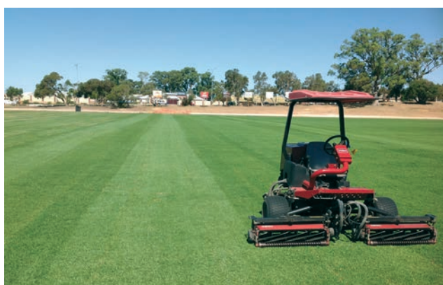
Triplex finishing mower provides a quality finish