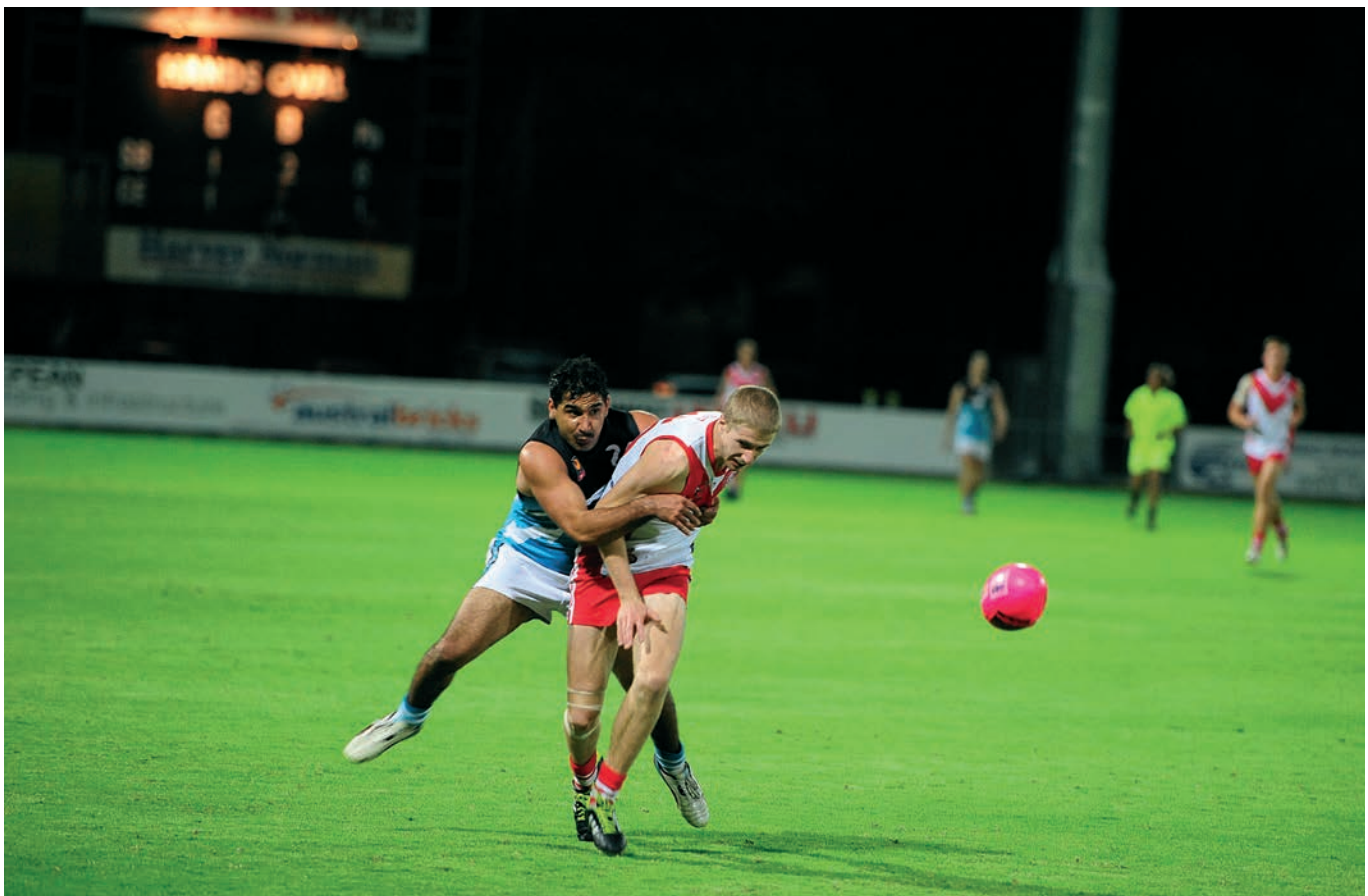
Hands Oval Bunbury