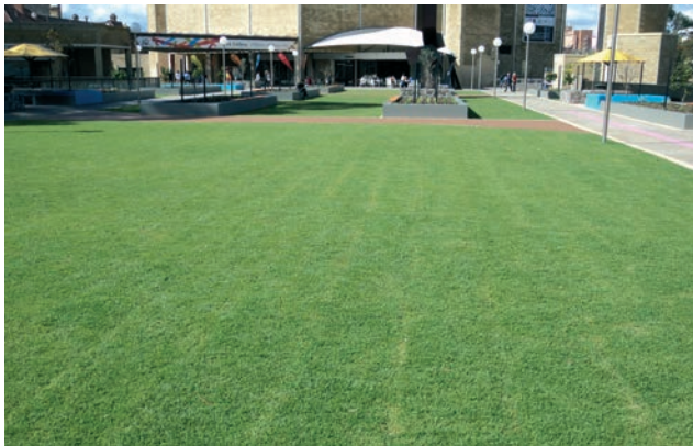
Well laid job