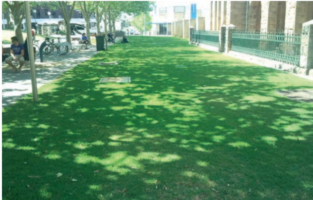
Village Green premium kikuyu tolerates dappled light